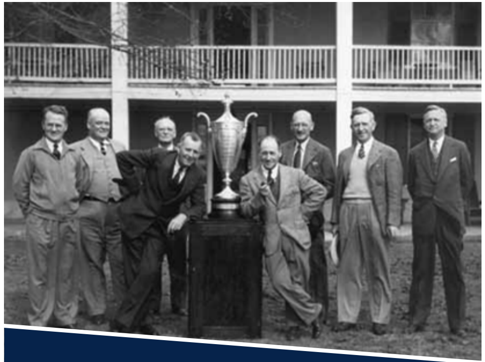
The inaugural Senior PGA Championship was played at Augusta National Golf Club in 1937.