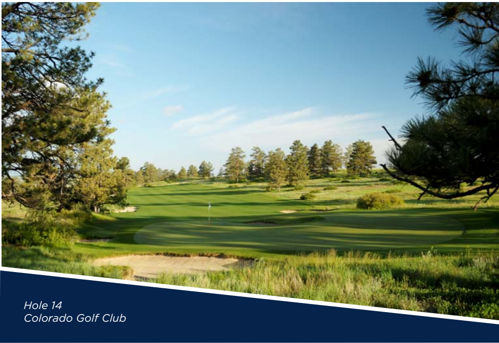
Hole 14 Colorado Golf Club