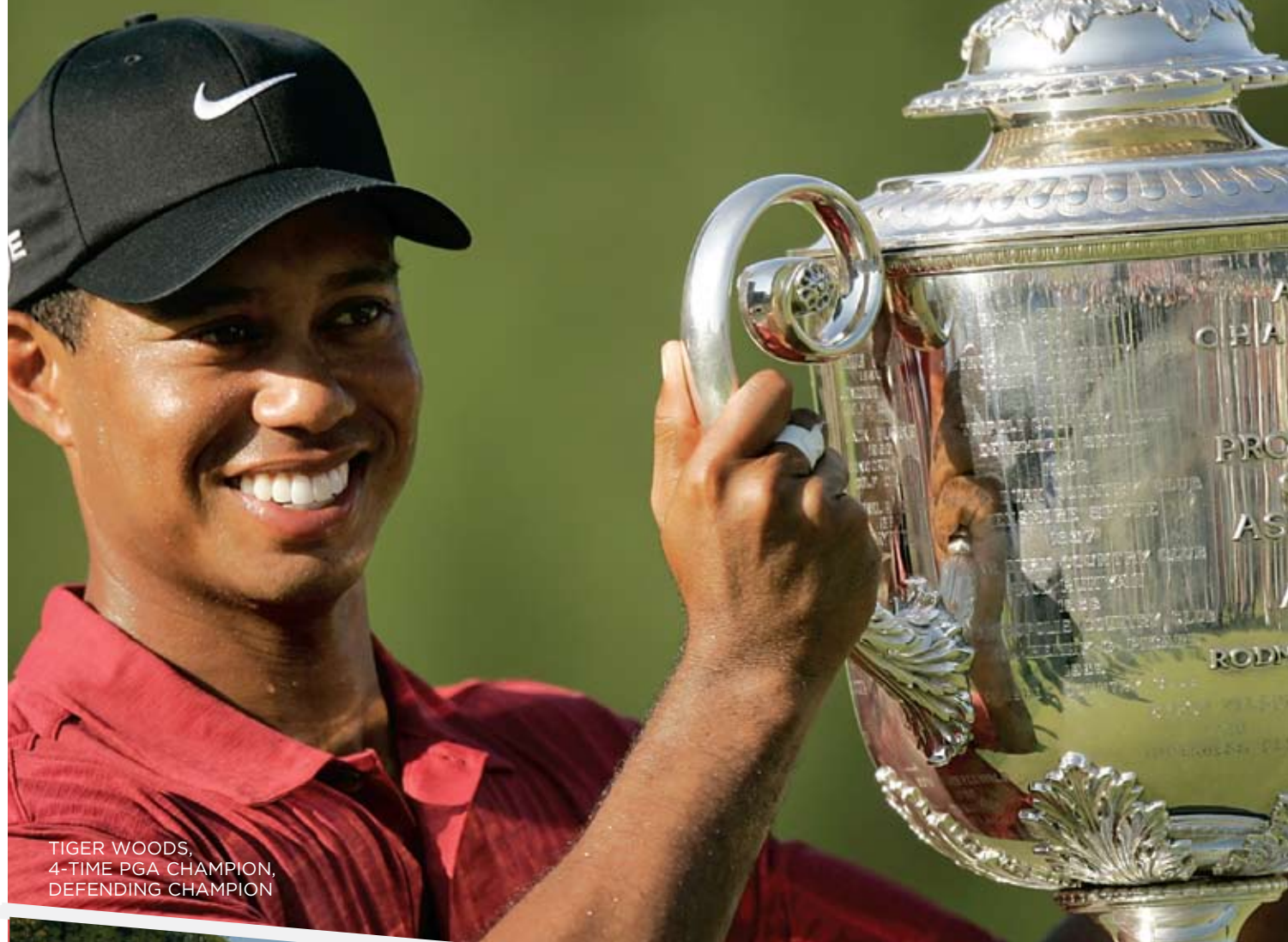
TIGER WOODS, 4-TIME PGA CHAMPION, DEFENDING CHAMPION